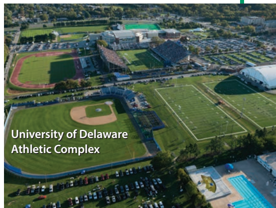
University of Delaware Athletic Complex

Visit www.udel.edu to learn more about the University.