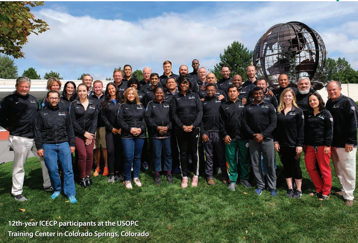
12th-year ICECP participants at the USOPC Training Center in Colorado Springs, Colorado

“This is a very high classed coaching course taking into consideration its content and intensity, great idea to keep, there should be a follow up of past participants after they pass through this program for an international network. There should be a physical exercise by all coaches as a group twice a week, a proper tour of the gym because some of us saw certain machines for the first time. Thanks for all the great work!”