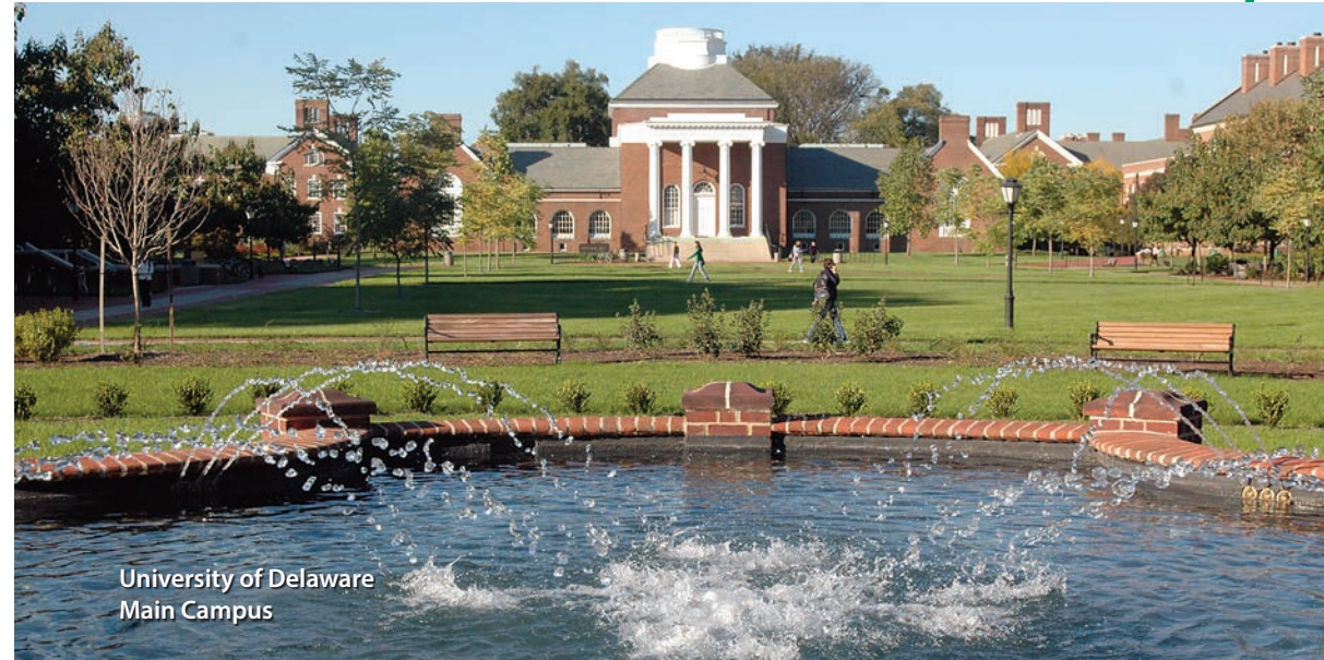
University of Delaware Main Campus

THE UNIVERSITY OF DELAWARE has grown from its founding as a small private academy in 1743 to a major university. The University offers an impressive collection of educational resources. The 16,000 undergraduate students may choose to major in any one or more of over 100 academic majors. The University's distinguished faculty includes internationally known scientists, authors and teachers, who are committed to continuing the University of Delaware's tradition in providing one of the highest quality undergraduate educations available in the United States.