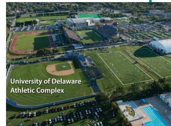
University of Delaware Athletic Complex

Visit www.udel.edu to learn more about the University.