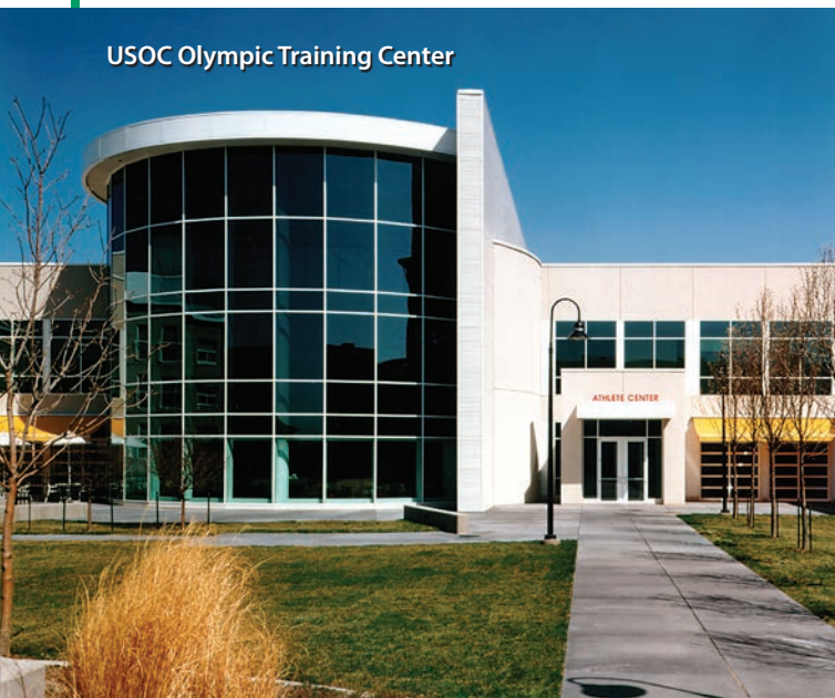
USOC Olympic Training Center

To learn more about the USOC visit: www.teamusa.org