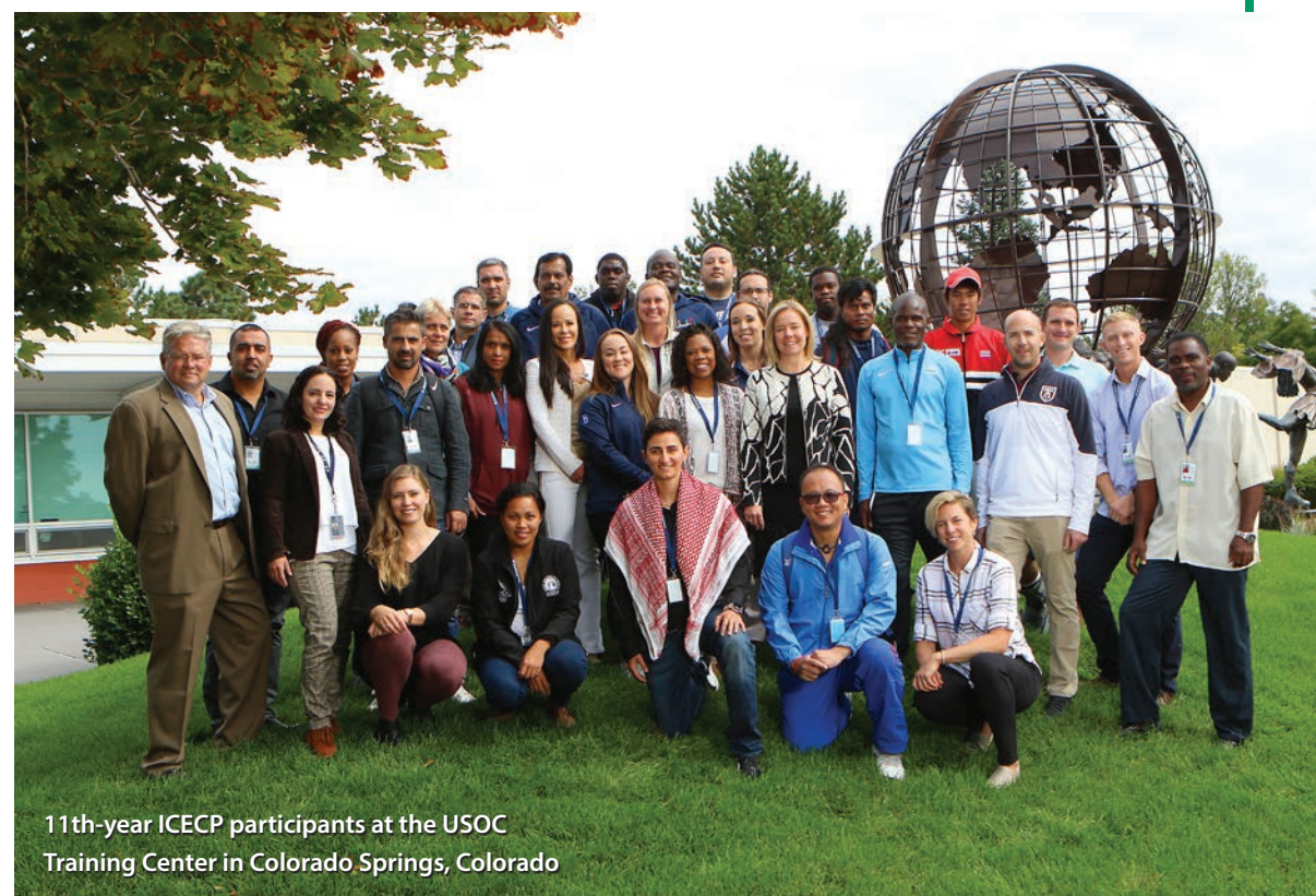
11th-year ICECP participants at the USOC Training Center in Colorado Springs, Colorado